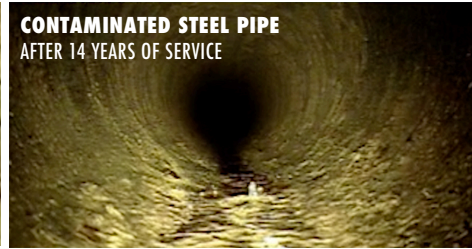
CONTAMINATED STEEL PIPE AFTER 14 YEARS OF SERVICE